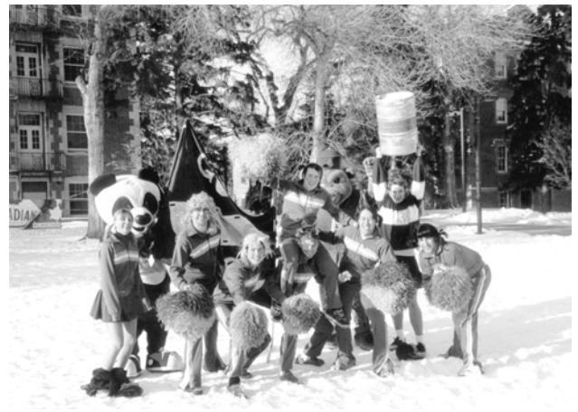
Winning Antifreeze Team: Sugar Shack

In its 5th year, this week-long event saw 24 teams of 13 participants each compete in 2 different categories. With 2 events each day, one during lunch and one in the evening, this action packed event showed off a ton of school spirit. Events ranged from a fashion show to "Chill" Leading to an Iron Chef Dessert competition. Funds were also raised for the Campus Food Bank. Prizes from sponsors included NHL hockey tickets, ski lift passes and mp3 players.