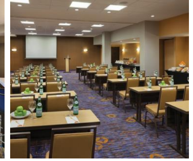
DON VALLEY ROOM