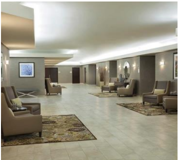
CONFERENCE RECEPTION FOYER